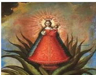
Image brought By Don Juan de Onate Colonists 1598 also by Don Diego de Vargas for the re-conquest in 1692